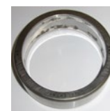
MARKET REF (LIX)