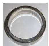
NYCO GREASE® GN 3058